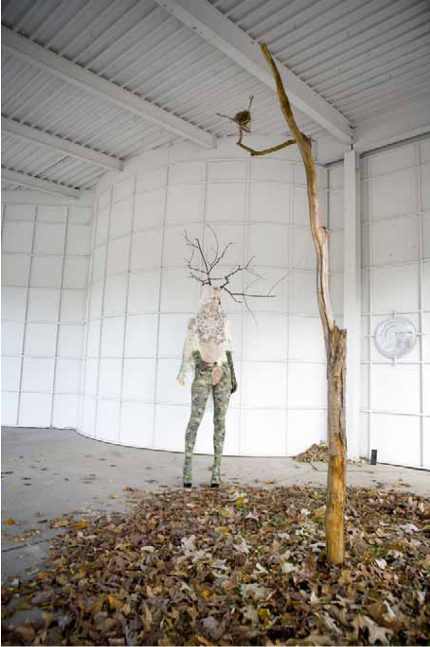
Shana Robbins, "Tree Ghost" performance view, 2008