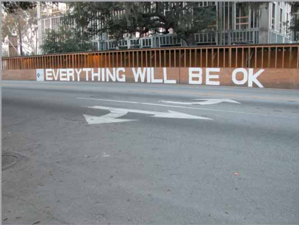
Jason Kofke • Everything Will Be OK, MLK BLVD • 2007 • 48"x80' • wheat paste, paper, paint on wood