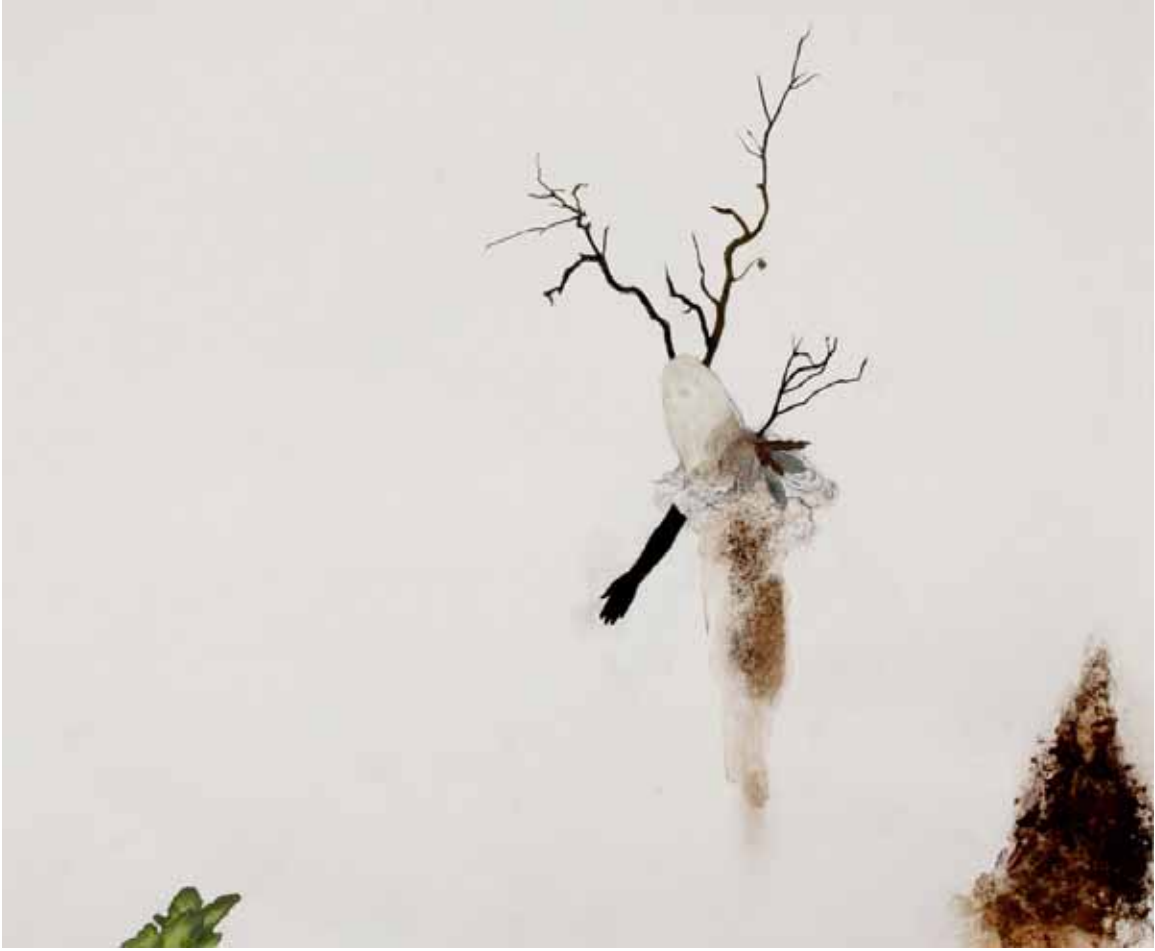
Shana Robbins, "Tree Ghost," Performance Drawing, 18" x 22", 2007