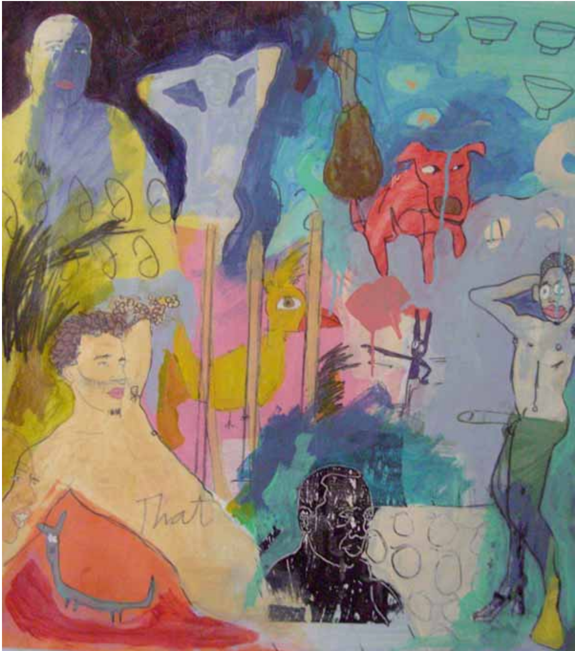
Rory Golden, Untitled from "Chickenbones" series, mixed-media drawing, 35" x 32", 2008