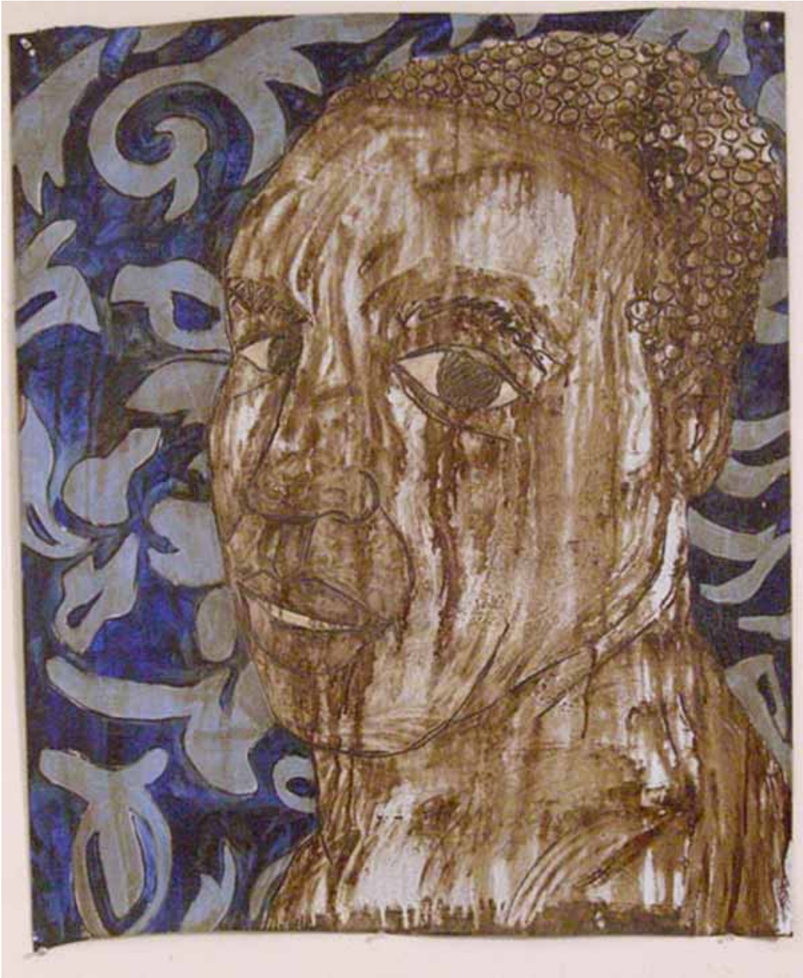
Rory Golden, "Blue David," tar, house paint, pencil and oil pain on roofing paper, 40" x 36" , 2007