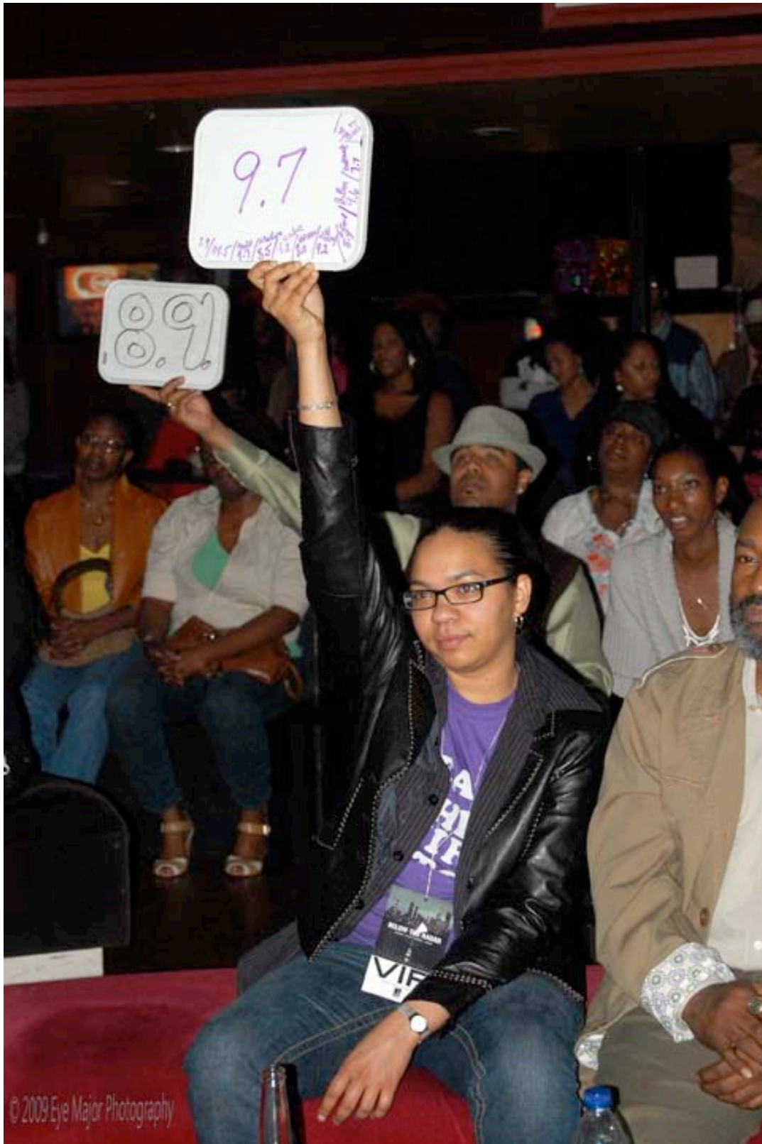
“Seria with Score Cards,” Rough Language , 2009